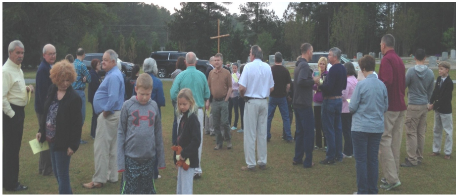
SUNRISE SERVICE WITH UPPER LONG CANE ATTENDANCE—51 WITH 31 FROM APC